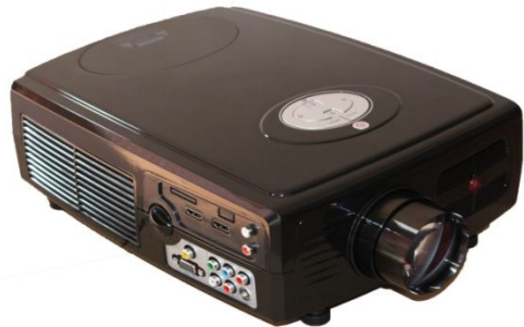
HDMI 1080i Projector