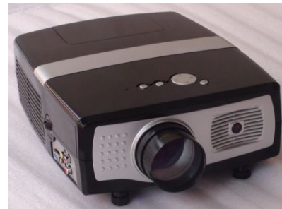
HDMI 1080P Projector